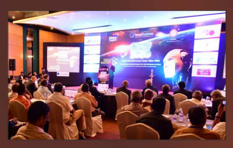
Delegates at GMCV 2030