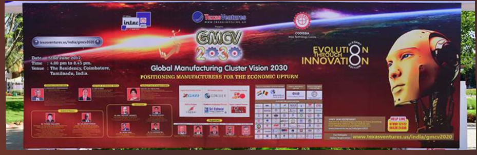
"GMCV 2030" Hoarding at Codissia Trade Fair Complex