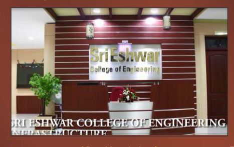
"SRI ESHWAR COLLEGE OF ENGINEERING"