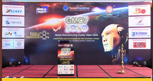
'GMCV 2030" MAIN STAGE