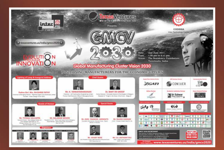
GMCV 2030 Advertisement in Afternoon Daily Newspaper on 1st June 2017