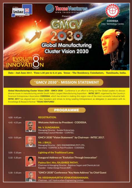
GMCV 2030 - EDM