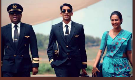
Visual Interlude of "SRILANKAN AIRLINES"