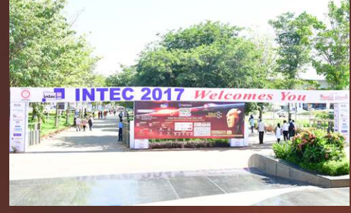
Entrance Arch at Codissia Trade Fair Complex