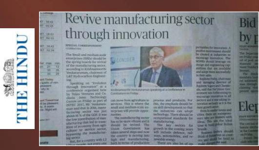
GMCV 2030 News Coverage in The Hindu Newspaper on 3rd June 2017