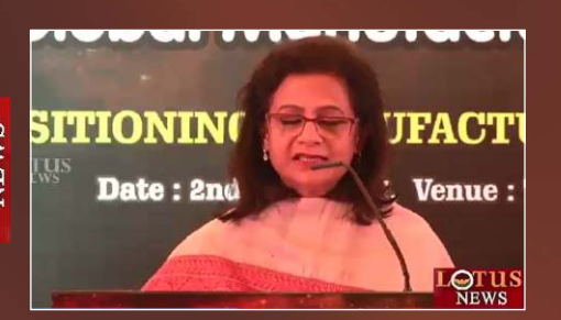
GMCV 2030 News Coverage at Lotus News TV Channel