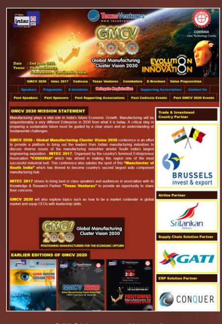
GMCV 2030 - Website