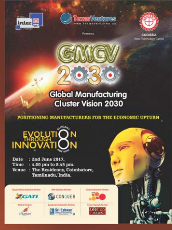
GMCV 2030 Advertisement in CODISSIA Bulletin on 1st June 2017